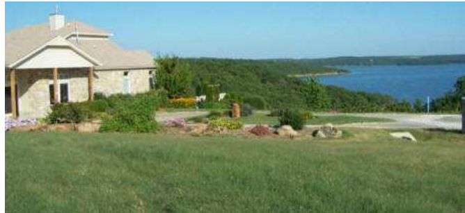
PERFECT FOR DRY, WINDY & SUNNY AREAS

LowMaintenanceLandscape.net 785-550-5610