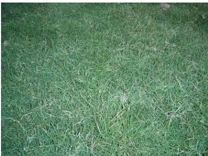
LEGACY BUFFALOGRASS CLOSE-UP