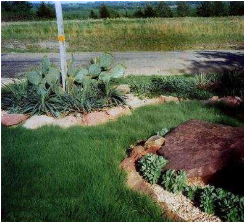
UN-MOWED BUFFALOGRASS; NO IRRIGATION

THIS LEGACY BUFFALO GRASS IN LAWRENCE KANSAS IS MOWED 4 TIMES PER YEAR AND RECEIVES VERY LITTLE EXTRA WATER. THE ULTRA DENSE GROWTH OF THE LEGACY BUFFALO GRASS COMBINED WITH A MINIMAL LAWN TREATMENT PLAN KEEPS IT WEED-FREE AND VERY LOW MAINTENANCE. THE LEGACY VARIETY MUST BE STARTED FROM PLUGS; SEED DOESN'T EXIST.