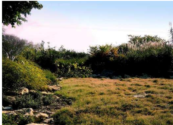
BUFFALOGRASS HAS ORANGE FALL COLOR