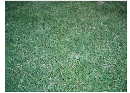
LEGACY BUFFALOGRASS CLOSE-UP