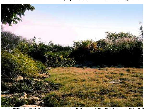
BUFFALOGRASS HAS ORANGE FALL COLOR