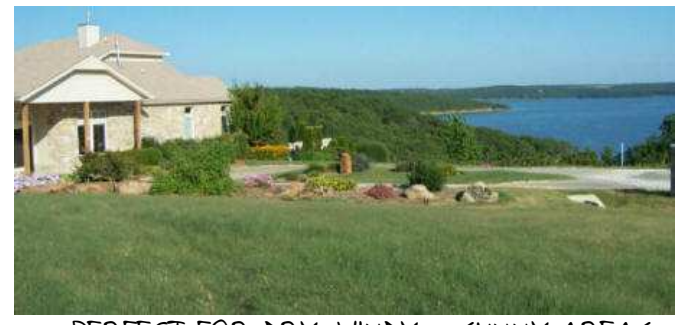
PERFECT FOR DRY, WINDY & SUNNY AREAS

LowMaintenanceLandscape.net 785-550-5610