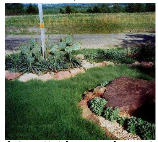
UN-MOWED BUFFALOGRASS; NO IRRIGATION